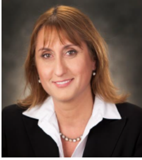
Orit Zuaretz- Israel; convening participant Former Member of the Israeli Knesset (Parliament), Israeli Group

Orit Zuaretz served as a member of the Israeli Parliament from 2009-2013, and has since served as the CEO of a company engaged in social and economic development in the former Soviet Union and Jordan. She has been a member of the Committee on the Status of Women, where she chaired the Subcommittee on Trafficking in Women and the Lobby for Including Women in Negotiations teams and implementation of UN Resolution 1325. Zuaretz is pursuing a Ph.D. in Middle East Studies from Haifa University, and received her MA in Middle East and Africa Studies from Tel-Aviv University. She has been involved with Defense and Foreign Affairs Committee and with Friends of Earth and Middle East. She was also the Israeli Knesset delegate to the Committee on Energy, Environment, and Water of the Parliamentary Assembly- Union for the Mediterranean. Zuaretz served three years in the Army's Intelligence Corps and speaks four languages.