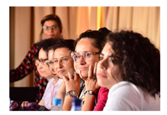
Morocco convening, July 2019